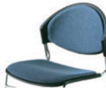
ST104 Fabric: Twilight