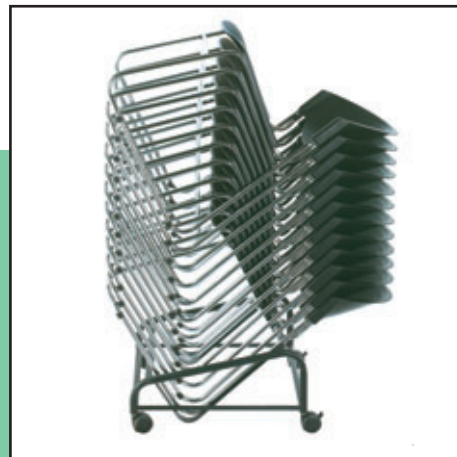
STDLY Dolly Stacking dolly for ST100, ST128, ST104 or ST111 facilitates transportation and storage.