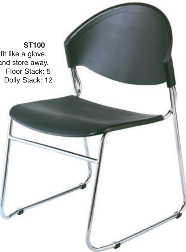
ST100 Molded plastic seat and back fit like a glove. Easy to set up, stack and store away. Floor Stack: 5 Dolly Stack: 12