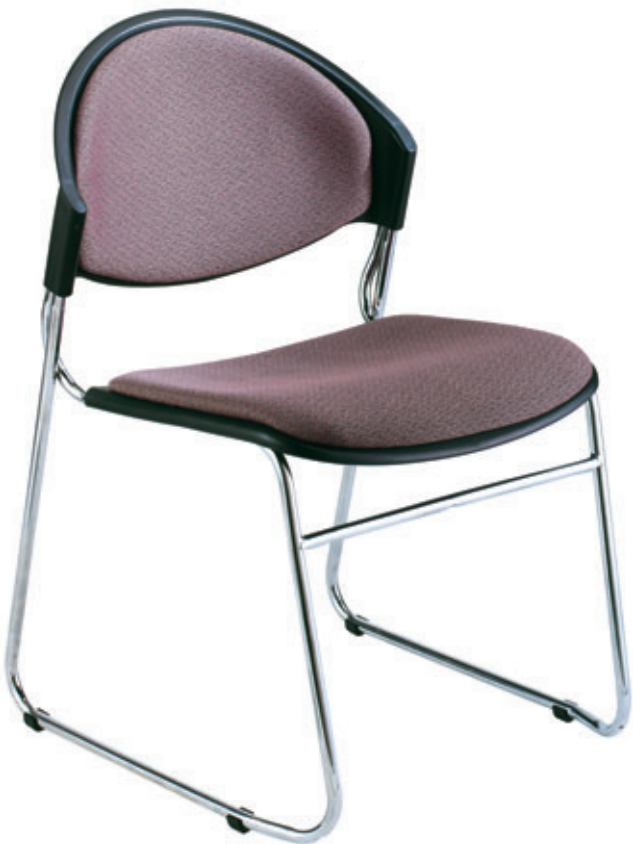
ST128 Cushioned seat and back for added comfort. Fabric: Eggplant Floor Stack: 4 Dolly Stack: 10