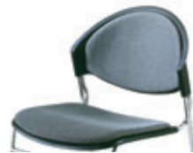
ST111 Fabric: Marble